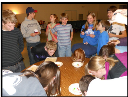
Eating contest during Youth Lock-In

May 30: Stop Hunger Now Meal Packaging event