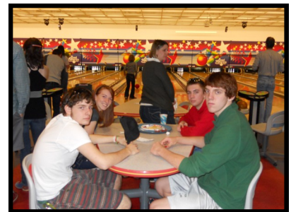
Mission Team members at the Bowl-A-Thon.